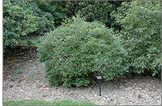
Mr. Poppins Winterberry