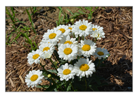
Sweet Daisy Jane Shasta Daisy in bloom

This plant will require occasional maintenance and upkeep. Trim off the flower heads after they fade and die to encourage more blooms late into the season. It is a good choice for attracting butterflies to your yard. Gardeners should be aware of the following characteristic(s) that may warrant special consideration;