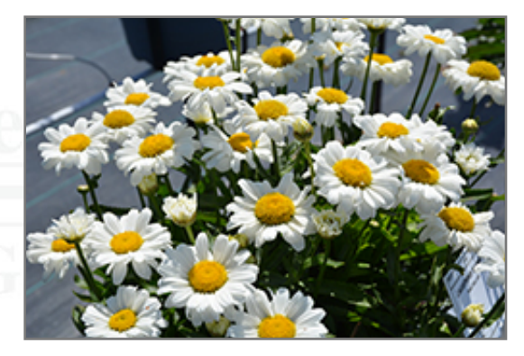
Sweet Daisy Jane Shasta Daisy flowers