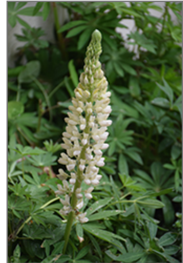
Popsicle White Lupine flowers