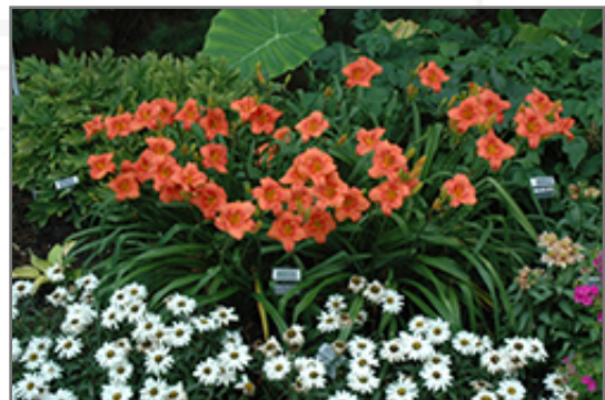
South Seas Daylily in bloom