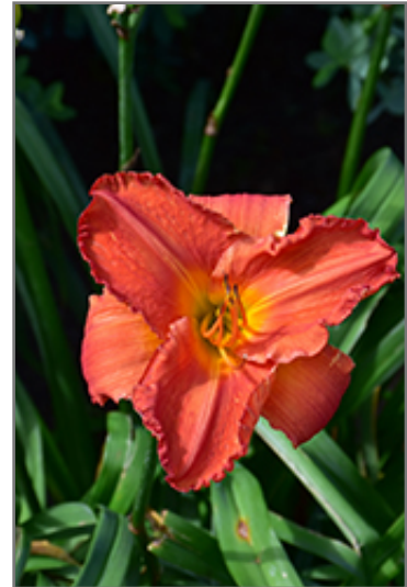
South Seas Daylily flowers

This is a relatively low maintenance plant, and is best cleaned up in early spring before it resumes active growth for the season. It is a good choice for attracting butterflies to your yard. It has no significant negative characteristics.