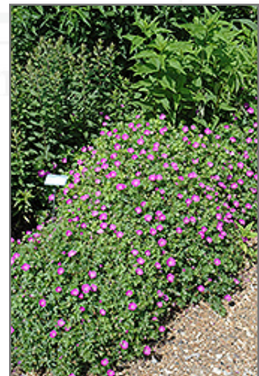
Max Frei Cranesbill in bloom