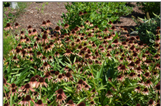
Fiery Meadow Mama Coneflower flowers