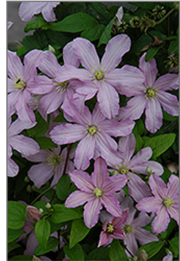
Madame de Bouchard Clematis flowers