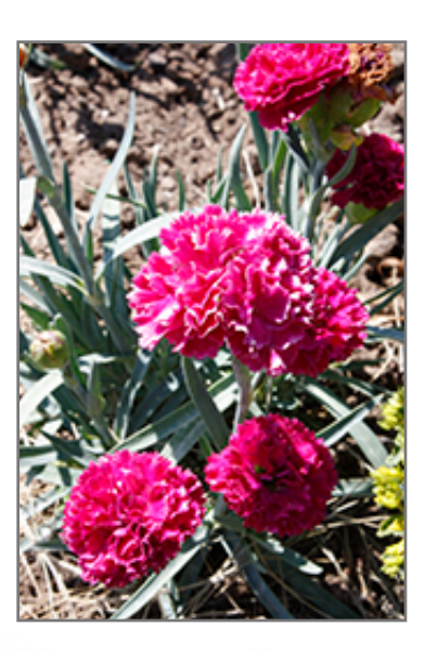
Fruit Punch Funky Fuchsia Pinks flowers

Heavily ruffled, fully double flowers are vibrant fuchsia, above mounds of silver blue foliage; great for flower arrangements; deadhead to rebloom; pair up with summer blooming perennials and annuals to time a continued flower display