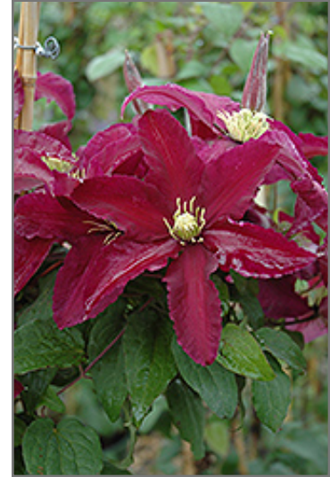
Niobe Clematis flowers