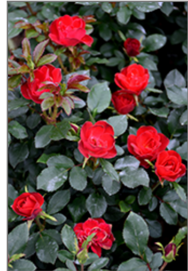
Petite Knock Out Rose flowers