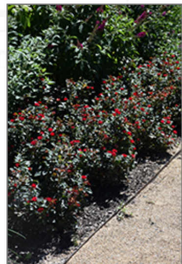
Petite Knock Out Rose in bloom