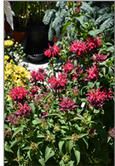
BeeMine Red Beebalm flowers

BeeMine Red Beebalm is an herbaceous perennial with a mounded form. Its medium texture blends into the garden, but can always be balanced by a couple of finer or coarser plants for an effective composition.