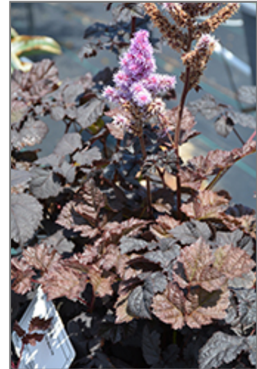
Dark Side Of The Moon Astilbe in bloom

Dark Side Of The Moon Astilbe will grow to be about 18 inches tall at maturity extending to 24 inches tall with the flowers, with a spread of 24 inches. When grown in masses or used as a bedding plant, individual plants should be spaced approximately 20 inches apart. Its foliage tends to remain dense right to the ground, not requiring facer plants in front. It grows at a medium rate, and under ideal conditions can be expected to live for approximately 10 years. As an herbaceous perennial, this plant will usually die back to the crown each winter, and will regrow from the base each spring. Be careful not to disturb the crown in late winter when it may not be readily seen!