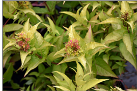
Honeybee Bush Honeysuckle flowers