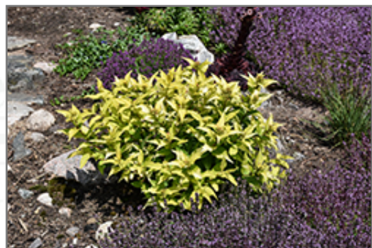
Honeybee Bush Honeysuckle in bloom