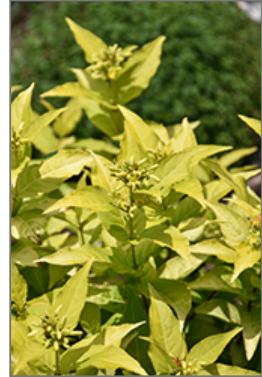
Honeybee Bush Honeysuckle flower buds

This shrub does best in full sun to partial shade. It is very adaptable to both dry and moist growing conditions, but will not tolerate any standing water. It is not particular as to soil type or pH. It is somewhat tolerant of urban pollution. This is a selection of a native North American species.