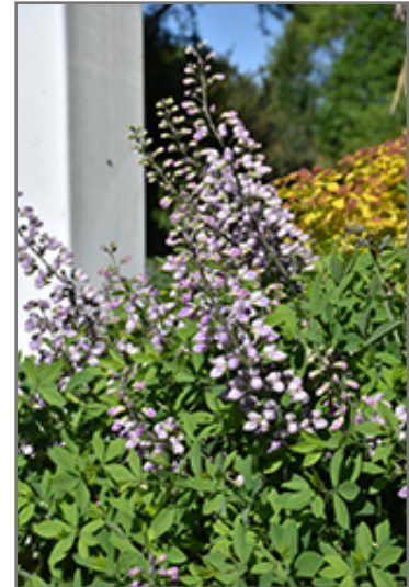
Decadence Deluxe Blue Bubbly False Indigo flowers

Numerous, long, lavender-blue spikes of pea-flowers rise above a tall habit of blue-green foliage in late spring;; use this plant for its outstanding display of vertical flowers, as an accent in the garden or borders; best in full sun