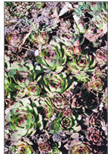
Kalinda Hens And Chicks