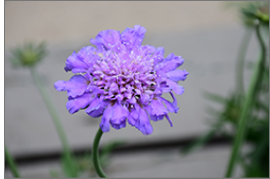
Butterfly Blue Pincushion Flower flowers

Butterfly Blue Pincushion Flower is recommended for the following landscape applications;