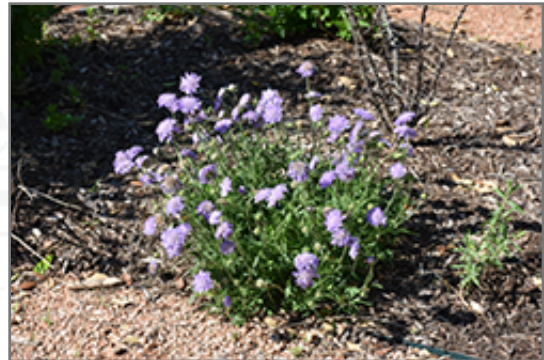
Butterfly Blue Pincushion Flower in bloom