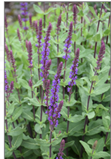
Caradonna Sage flowers