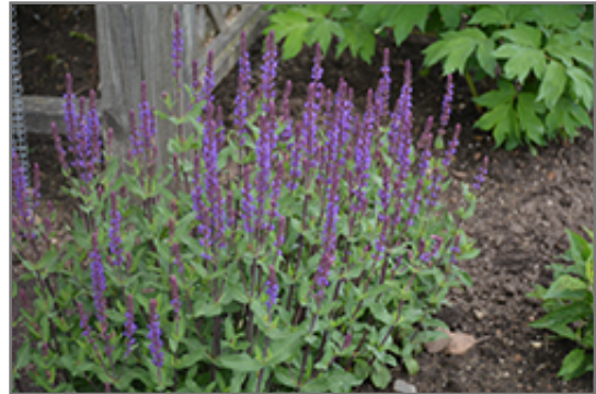
Caradonna Sage in bloom

Caradonna Sage is an herbaceous perennial with an upright spreading habit of growth. Its relatively fine texture sets it apart from other garden plants with less refined foliage.