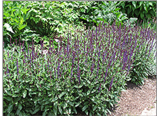
Caradonna Sage in bloom