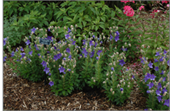
Astra Blue Balloon Flower in bloom

Astra Blue Balloon Flower will grow to be about 12 inches tall at maturity, with a spread of 12 inches. When grown in masses or used as a bedding plant, individual plants should be spaced approximately 9 inches apart. Its foliage tends to remain dense right to the ground, not requiring facer plants in front. It grows at a medium rate, and under ideal conditions can be expected to live for approximately 10 years. As an herbaceous perennial, this plant will usually die back to the crown each winter, and will regrow from the base each spring. Be careful not to disturb the crown in late winter when it may not be readily seen!