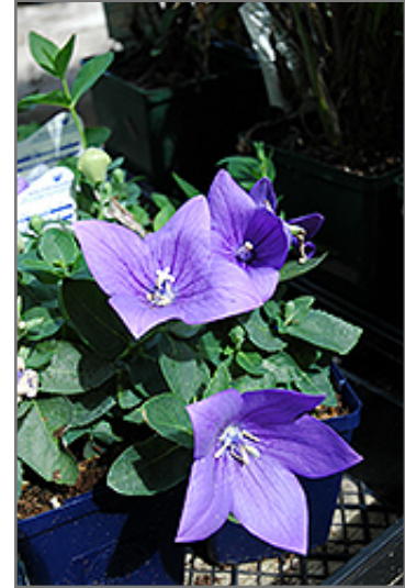
Astra Blue Balloon Flower flowers