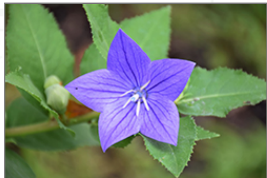
Astra Blue Balloon Flower flowers