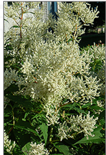
White Fleecflower flowers