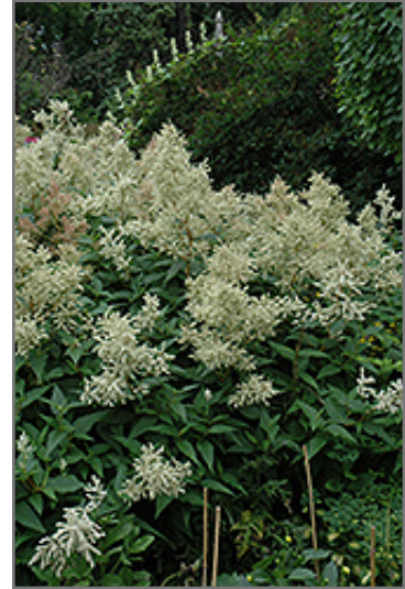
White Fleecflower in bloom