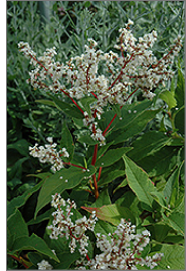
White Fleeceflower flowers

This plant does best in full sun to partial shade. It prefers to grow in average to moist conditions, and shouldn't be allowed to dry out. It is not particular as to soil type or pH. It is highly tolerant of urban pollution and will even thrive in inner city environments. This species is not originally from North America. It can be propagated by division.