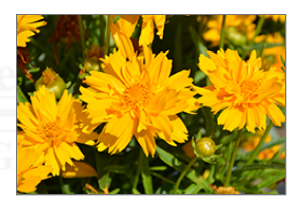
Double the Sun Tickseed flowers

This is a relatively low maintenance plant, and is best cleaned up in early spring before it resumes active growth for the season. It is a good choice for attracting butterflies to your yard, but is not particularly attractive to deer who tend to leave it alone in favor of tastier treats. It has no significant negative characteristics.