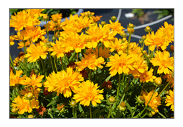
Double the Sun Tickseed in bloom

Double the Sun Tickseed is an herbaceous perennial with a mounded form. Its relatively fine texture sets it apart from other garden plants with less refined foliage.