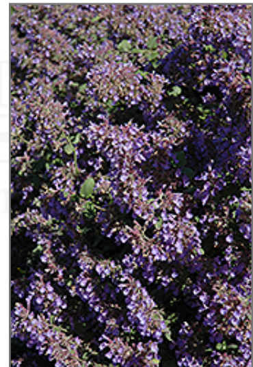
Walker's Low Catmint flowers