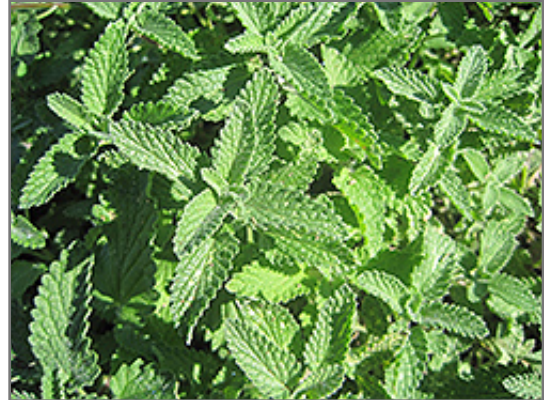
Walker's Low Catmint foliage

Walker's Low Catmint will grow to be about 12 inches tall at maturity extending to 16 inches tall with the flowers, with a spread of 12 inches. Its foliage tends to remain dense right to the ground, not requiring facer plants in front. It grows at a fast rate, and under ideal conditions can be expected to live for approximately 10 years. As an herbaceous perennial, this plant will usually die back to the crown each winter, and will regrow from the base each spring. Be careful not to disturb the crown in late winter when it may not be readily seen!