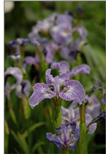
Dwarf Arctic Iris flowers

Dwarf Arctic Iris is recommended for the following landscape applications;