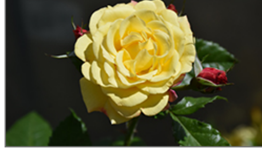
Rugelda Rose flowers

An unusual pavement rugosa, featuring yellow, fully double flowers tinged with pink, that are repeat-blooming; tall, upright habit with dark green glossy foliage; resistant to disease, makes a great specimen shrub; needs full sun and well-drained soil