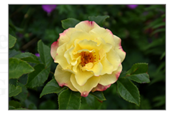
Rugelda Rose flowers

This is a high maintenance shrub that will require regular care and upkeep, and is best pruned in late winter once the threat of extreme cold has passed. It is a good choice for attracting bees to your yard. Gardeners should be aware of the following characteristic(s) that may warrant special consideration;