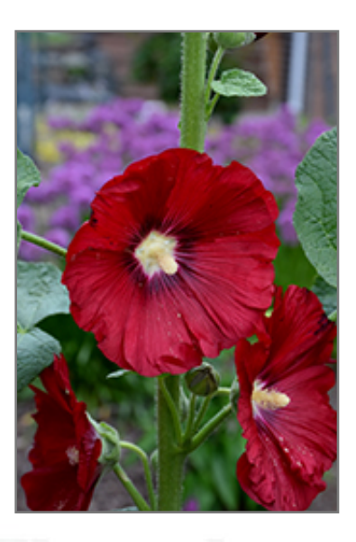
Mars Magic Hollyhock flowers

Featuring stunning deep red flowers with cream centers, on towering spikes in midsummer; tolerant to the natural toxin formed by the roots of Black Walnut; selections from this series are truly perennial; plant in full sun for better growth