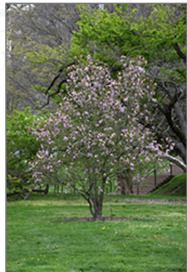
Ricki Magnolia in bloom