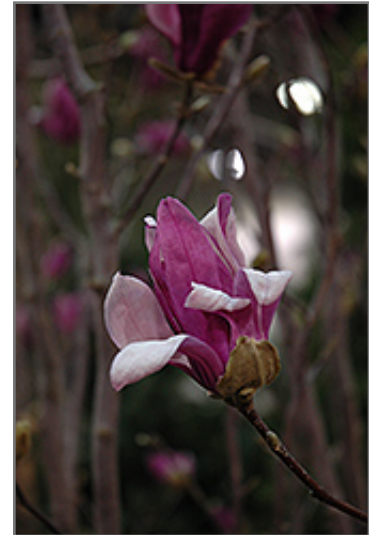
Ricki Magnolia flowers