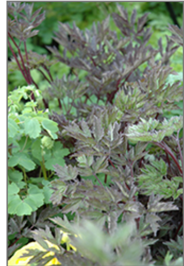
Hillside Black Beauty Bugbane

A native perennial presenting numerous spikes of fragrant, white flowers that are blushed with pink, in mid to late summer; contrasting dark purplish-black foliage; shelter from strong winds; perfect for a shady, woodland garden