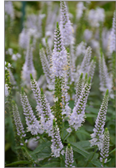
First Memory Speedwell flowers

Very easy to grow and virtually maintenance-free; flower spikes are tightly bunched and upright, producing lovely, long flowering, soft blue flowers from the bottom up; makes an ideal garden accent, great in rock gardens