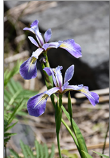
Blue Flag Iris flowers