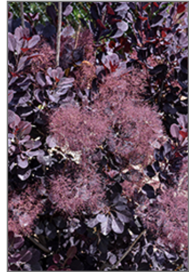
Velveteeny Purple Smokebush flowers

Velveteeny Purple Smokebush is recommended for the following landscape applications;