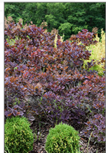
Velveteeny Purple Smokebush