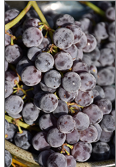
Sovereign Coronation Grape fruit

Sovereign Coronation Grape has rich green deciduous foliage on a plant with a spreading habit of growth. The lobed leaves turn yellow in fall. It produces abundant clusters of deep purple grapes with powder blue overtones from early to mid fall.