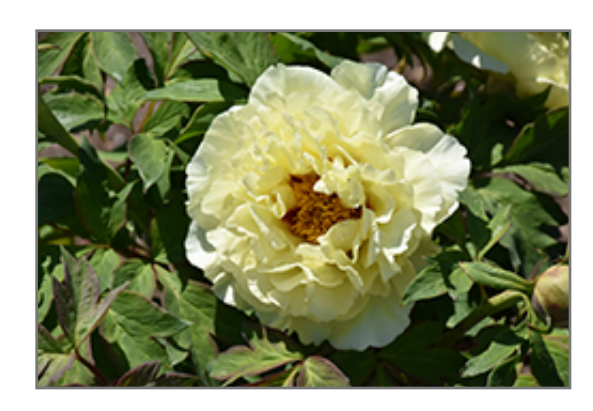
High Noon Tree Peony flowers

A beautiful woody peony, producing huge, frilly, lemon yellow flowers with brushes of red; great as an accent in the garden or massed along borders; unlike perennial peonies, remember not to prune this variety