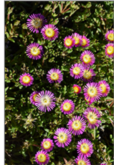
Wheels of Wonder Hot Pink Wonder Ice Plant flowers

A low growing succulent, native to South Africa but amazingly hardy in North America; dazzling hot pink daisy-like flowers with yellow centers; green foliage has burgundy overtones in fall; perfect for xeriscapes, rock gardens, screens and sandy soils