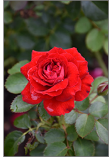
Canadian Shield Rose flowers