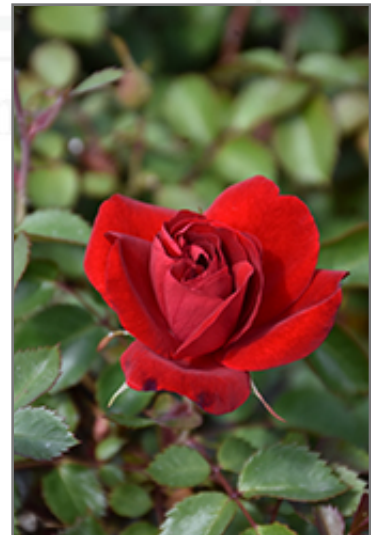
Canadian Shield Rose flowers