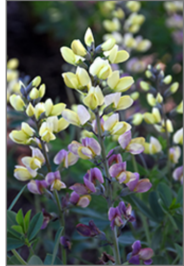
Decadence Deluxe Pink Lemonade False Indigo flowers

Decadence Deluxe Pink Lemonade False Indigo is an herbaceous perennial with an upright spreading habit of growth. Its medium texture blends into the garden, but can always be balanced by a couple of finer or coarser plants for an effective composition.