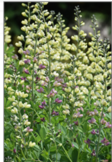
Decadence Deluxe Pink Lemonade False Indigo flowers