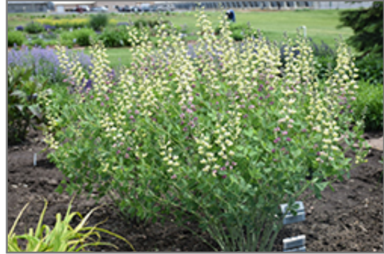
Decadence Deluxe Pink Lemonade False Indigo in bloom

Decadence Deluxe Pink Lemonade False Indigo is a fine choice for the garden, but it is also a good selection for planting in outdoor pots and containers. With its upright habit of growth, it is best suited for use as a 'thriller' in the 'spiller-thriller-filler' container combination; plant it near the center of the pot, surrounded by smaller plants and those that spill over the edges. It is even sizeable enough that it can be grown alone in a suitable container. Note that when growing plants in outdoor containers and baskets, they may require more frequent waterings than they would in the yard or garden. Be aware that in our climate, most plants cannot be expected to survive the winter if left in containers outdoors, and this plant is no exception. Contact our experts for more information on how to protect it over the winter months.