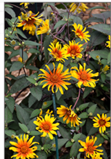
Burning Hearts False Sunflower flowers