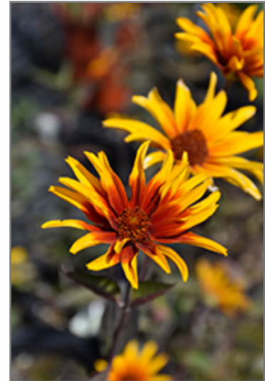
Burning Hearts False Sunflower flowers

Burning Hearts False Sunflower has masses of beautiful gold daisy flowers with coppery-bronze eyes and a tomato-orange ring at the ends of the stems from early summer to mid fall, which are most effective when planted in groupings. The flowers are excellent for cutting. Its serrated oval leaves emerge green in spring, turning dark green in colour with showy deep purple variegation throughout the season. The deep purple stems can be quite attractive.