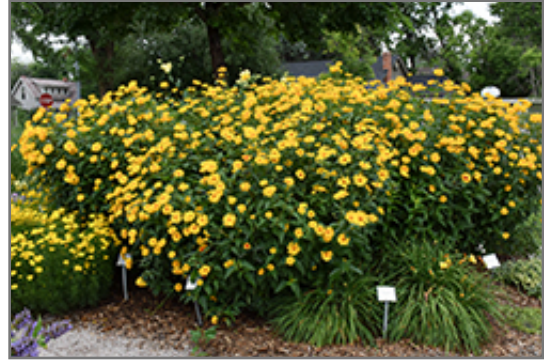
Burning Hearts False Sunflower in bloom

This plant does best in full sun to partial shade. It is very adaptable to both dry and moist locations, and should do just fine under typical garden conditions. It is not particular as to soil type or pH, and is able to handle environmental salt. It is highly tolerant of urban pollution and will even thrive in inner city environments. This is a selection of a native North American species. It can be propagated by division; however, as a cultivated variety, be aware that it may be subject to certain restrictions or prohibitions on propagation.