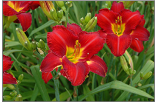
Chicago Apache Daylily flowers