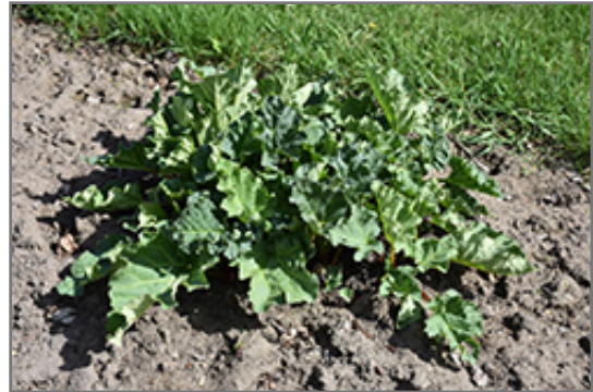
Victoria Rhubarb