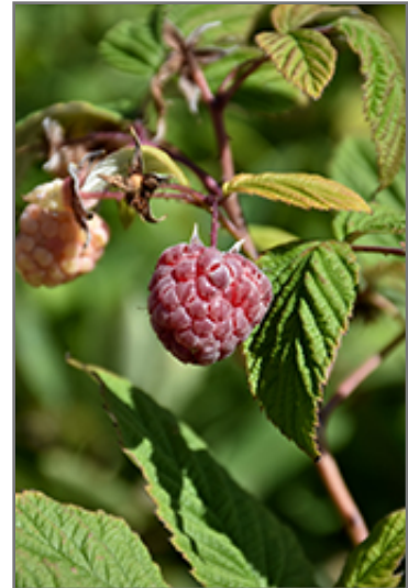
Royalty Raspberry fruit

Royalty Raspberry has rich green deciduous foliage on a plant with an upright spreading habit of growth. The fuzzy oval compound leaves do not develop any appreciable fall colour. It features an abundance of magnificent burgundy berries in mid summer, which fade to deep purple over time.