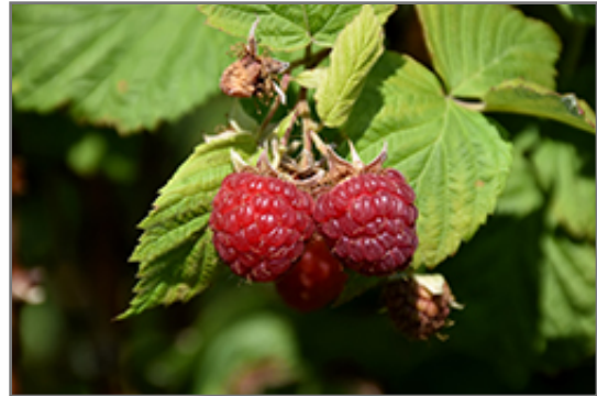
Nova Raspberry fruit

Nova Raspberry has rich green deciduous foliage on a plant with an upright spreading habit of growth. The fuzzy oval compound leaves do not develop any appreciable fall colour. It features an abundance of magnificent red berries in mid summer.