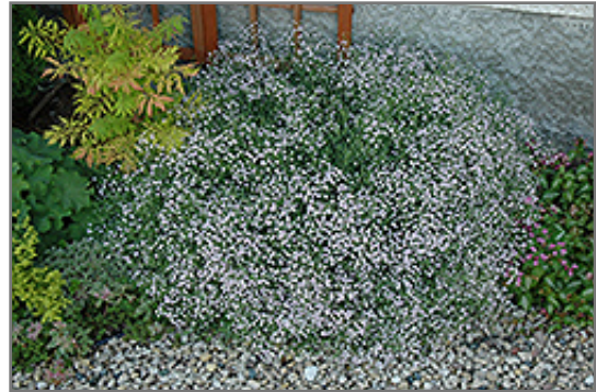
Common Baby's Breath in bloom