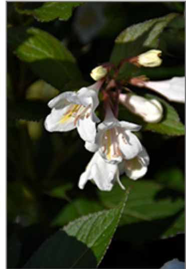
Tuxedo Weigela flowers

Tuxedo Weigela makes a fine choice for the outdoor landscape, but it is also well-suited for use in outdoor pots and containers. Because of its height, it is often used as a 'thriller' in the 'spiller-thriller-filler' container combination; plant it near the center of the pot, surrounded by smaller plants and those that spill over the edges. It is even sizeable enough that it can be grown alone in a suitable container. Note that when grown in a container, it may not perform exactly as indicated on the tag - this is to be expected. Also note that when growing plants in outdoor containers and baskets, they may require more frequent waterings than they would in the yard or garden. Be aware that in our climate, most plants cannot be expected to survive the winter if left in containers outdoors, and this plant is no exception. Contact our experts for more information on how to protect it over the winter months.