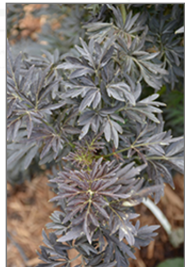
Laced Up Elder foliage