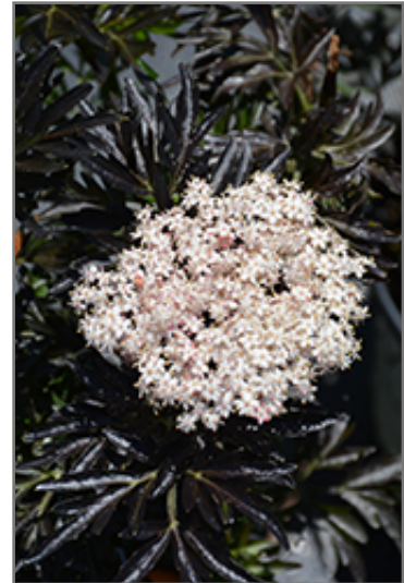
Laced Up Elder flowers