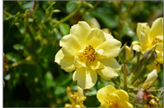
Oso Easy Lemon Zest Rose flowers