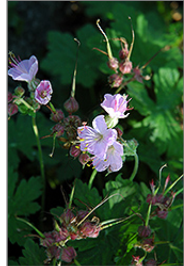
Ingerwesen's Variety Cranesbill flowers

Ingerwesen's Variety Cranesbill is recommended for the following landscape applications;