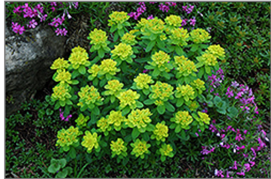
Cushion Spurge in bloom

Cushion Spurge is recommended for the following landscape applications;