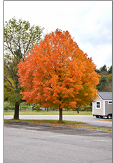
Sugar Maple in fall