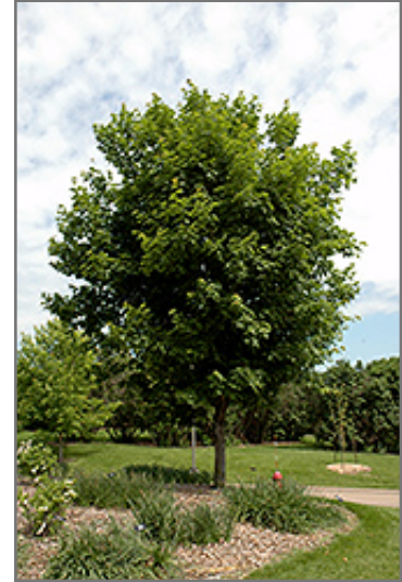
Sugar Maple

This tree should only be grown in full sunlight. It prefers to grow in average to moist conditions, and shouldn't be allowed to dry out. It is not particular as to soil pH, but grows best in rich soils. It is somewhat tolerant of urban pollution. This species is native to parts of North America.