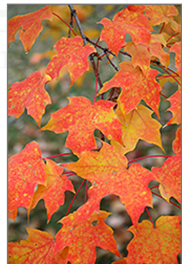
Sugar Maple in fall