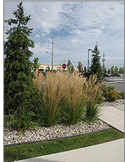
Karl Foerster Reed Grass in bloom

Karl Foerster Reed Grass is a fine choice for the garden, but it is also a good selection for planting in outdoor pots and containers. With its upright habit of growth, it is best suited for use as a 'thriller' in the 'spiller-thriller-filler' container combination; plant it near the center of the pot, surrounded by smaller plants and those that spill over the edges. It is even sizeable enough that it can be grown alone in a suitable container. Note that when growing plants in outdoor containers and baskets, they may require more frequent waterings than they would in the yard or garden. Be aware that in our climate, most plants cannot be expected to survive the winter if left in containers outdoors, and this plant is no exception. Contact our experts for more information on how to protect it over the winter months.