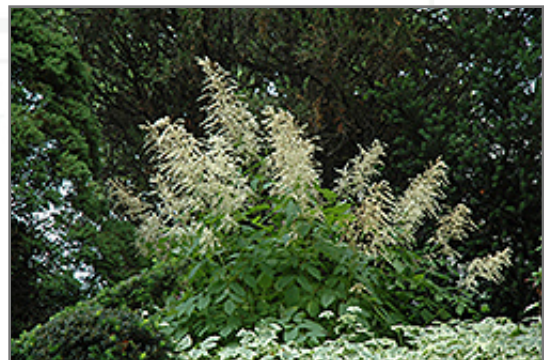
Goatsbeard in bloom