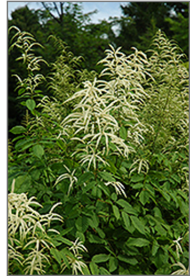
Goatsbeard flowers

Goatsbeard is recommended for the following landscape applications;