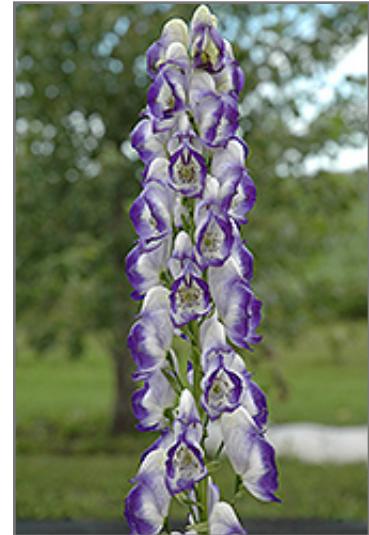
Bicolor Monkshood flowers