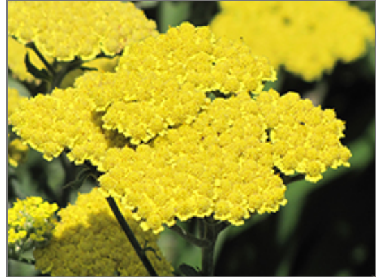
Moonshine Yarrow flowers

Moonshine Yarrow is recommended for the following landscape applications;